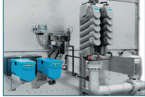
Fig. 3: Smart Shield® on Condenser Application

EVAPCO Smart Shield® is Factory Mounted on coil products (Figure 3) and/or Skid Mounted for cooling towers and remote sump designs (Figure 4).